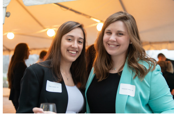
Image 4.0.1. 9th annual Alumni and Senior Banquet was held on May 3, 2019, GHH, RWU Bristol Campus