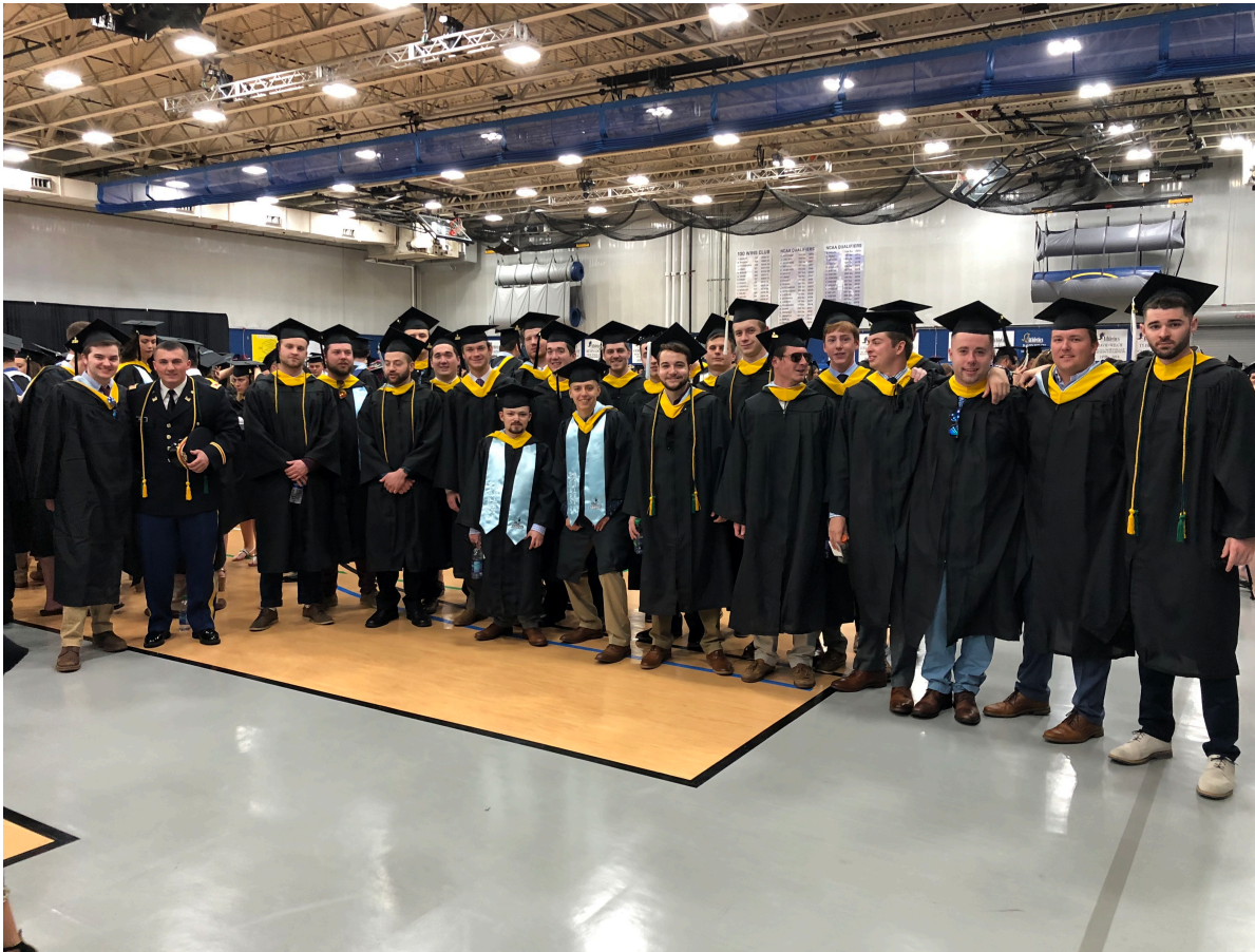
Image 4.0.2. Construction Management Class of 2019