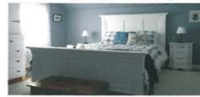
HARBOR ROOM - QUEEN BED

Bristol House offers our guests a comfortable & relaxing getaway. All of our guestrooms offer PRIVATE bathrooms. We invite you to make yourself at home & experience comfortable luxury!