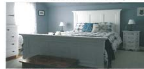
HARBOR ROOM - QUEEN BED

Bristol House offers our guests a comfortable & relaxing getaway. All of our guestrooms offer PRIVATE bathrooms. We invite you to make yourself at home & experience comfortable luxury!