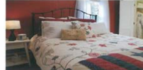
INDEPENDENCE ROOM - QUEEN BED