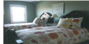
MT. HOPE ROOM - 2 TWIN OR KING BED