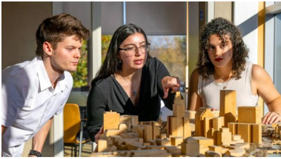
professionals and contemporary practice.

The Cummings School of Architecture offers rigorous programs in architecture, historic preservation, and related design disciplines that prepare students to address complex challenges in the built environment. Faculty members bring professional practice experience and scholarly expertise into the classroom, mentoring students through studio-based learning, research, and real-world projects. The school's nationally recognized Architecture Teaching Firm in Residence Program connects students directly with leading architecture