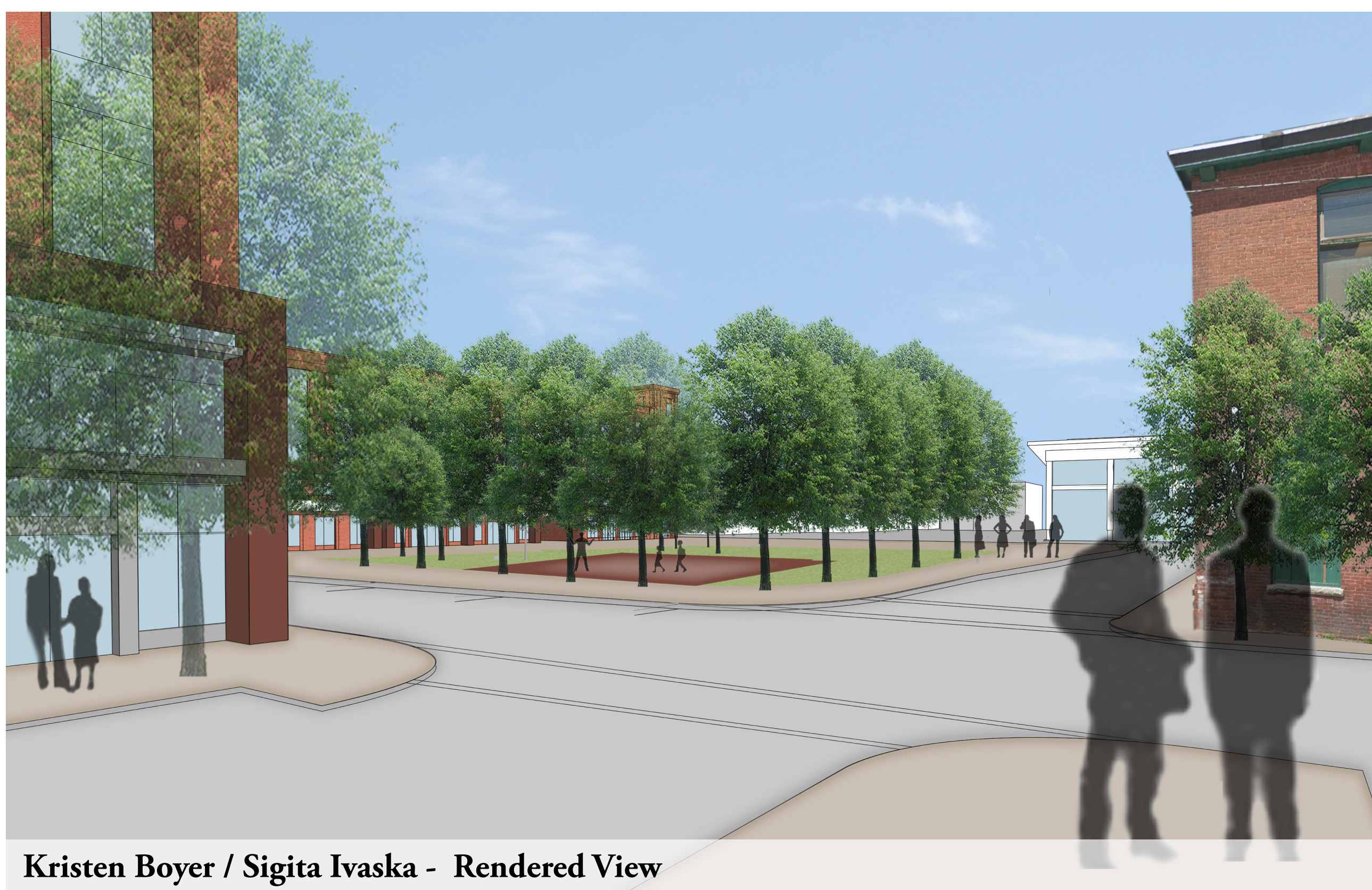
Kristen Boyer / Sigita Ivaska - Rendered View