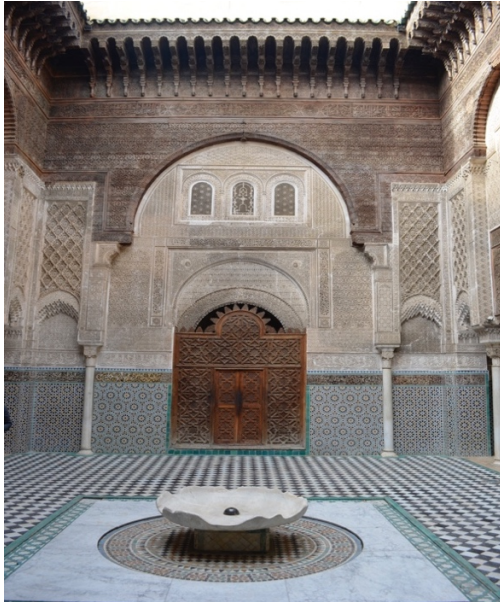
Université al Quaraouiyyine The World's Oldest University, Fes, Morocco

The mission of SASH is to provide an opportunity for undergraduate and graduate students to share their academic and creative activities with the RWU community. SASH represents our collective intellectual accomplishments as a university during the academic year.