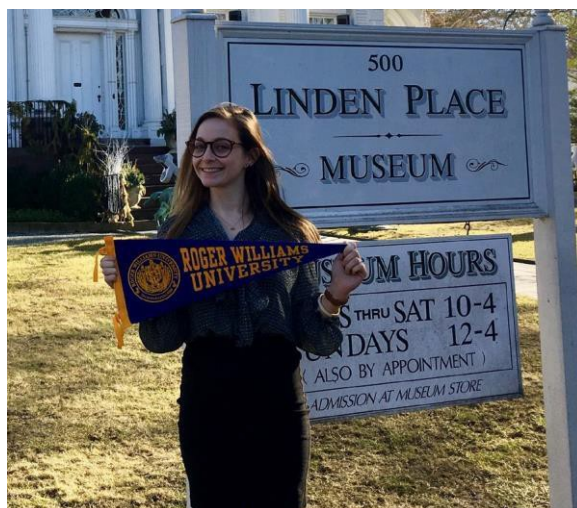
Internship Site: Linden Place Museum

*Students wishing to receive more than 6 credits please contact CCPD