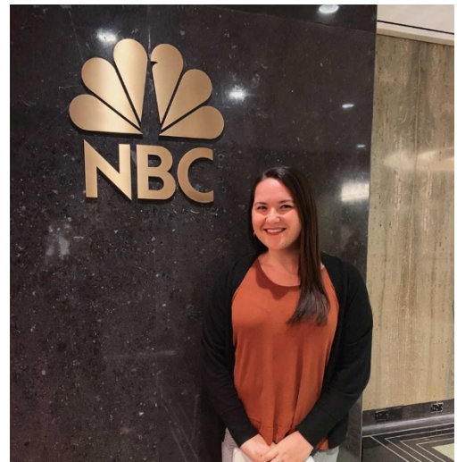
Internship Site: NBCUniversal Media

"'Live from New York' it is the end of an incredible semester with NBCUniversal Media, LLC. I am so grateful I had the opportunity to work for an amazing company on such a hard working team. I am thankful for the hands-on experience and exposure I was able to get while working on the Content Distribution Marketing team."