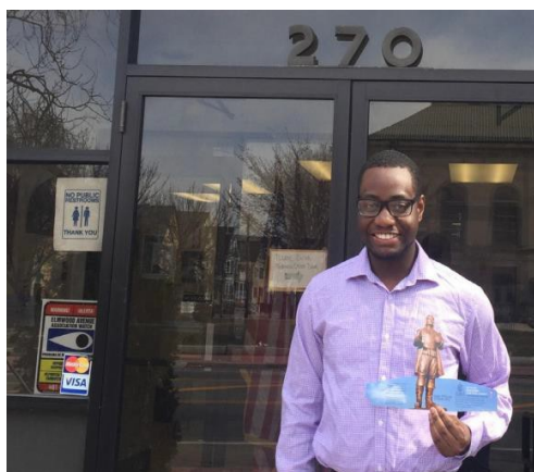
Internship Site: CSEA

“I would say for anyone who is considering doing an internship in his or her field of study to do it. Doing an internship provide real life experience that will make one more marketable to employers. It’s also a great way to put in practice the knowledge that you learn inside the classroom.”