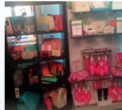
Fashion PR firm set ups