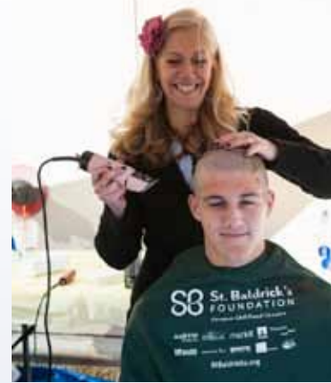
St. Balderick's Day event in action