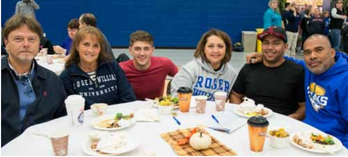
Families and Students enjoying our Annual Autumn Luncheon