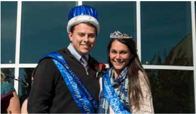
Homecoming King and Queen