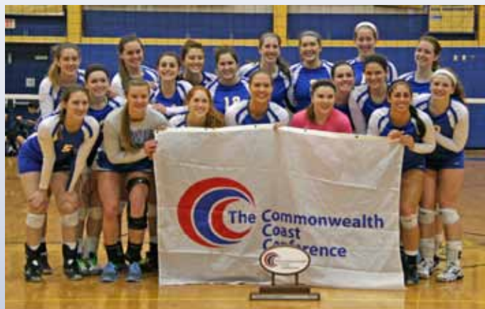
Volleyball Team Celebrates CCC Championship