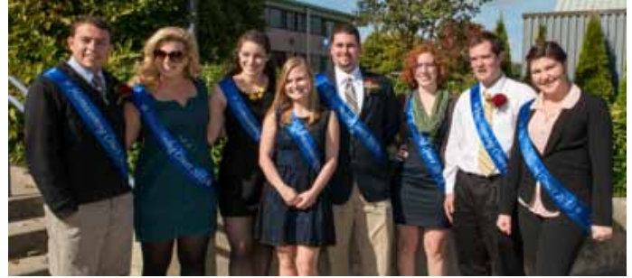
Homecoming Court 2013