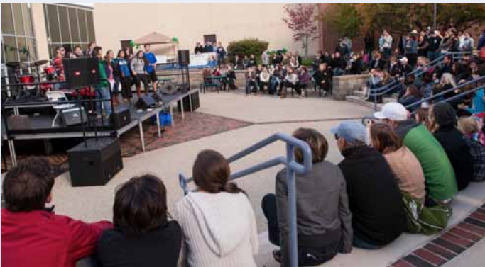
Live music is always a family favorite at Autumnfest