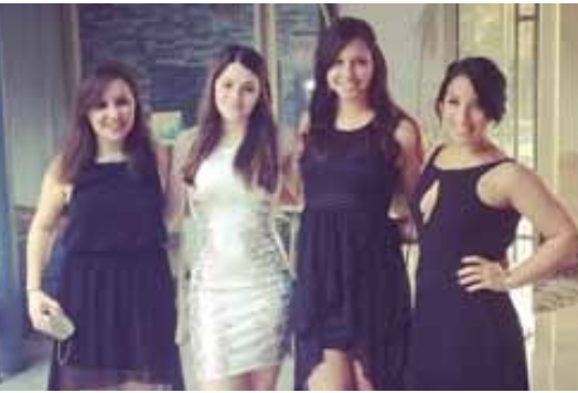
Ready to go to People's Choice awards.