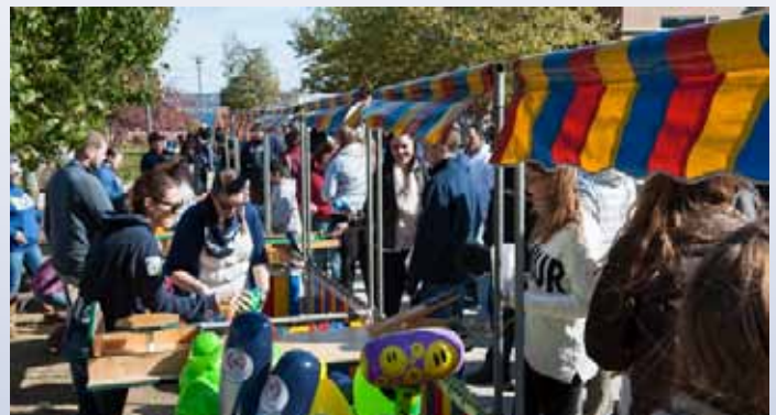
Children of all ages enjoyed carnival games and prizes