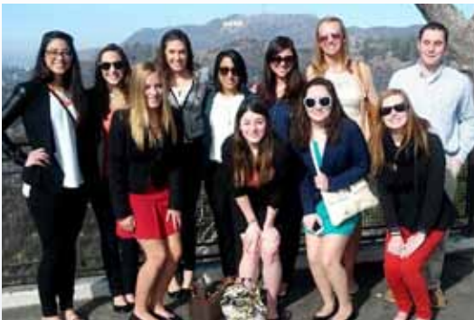
Group shot from Griffith Observatory