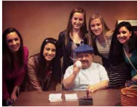
Meeting stars from Chelsea Lately