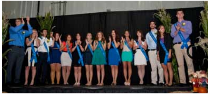
Homecoming Court 2012