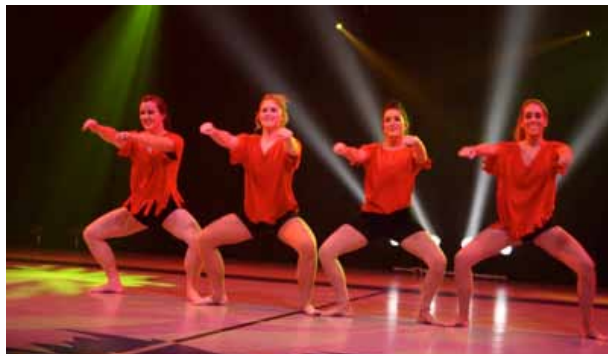
Dance Club Annual Fall Show