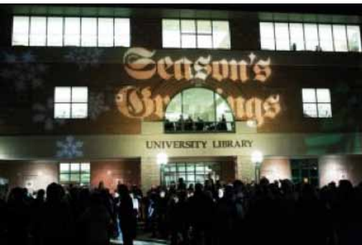
RWU Campus Community enjoying the Annual Winter Illuminations Celebration