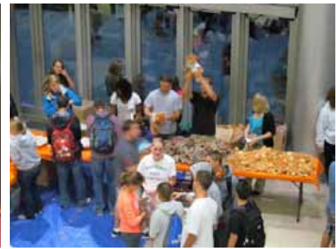
CEN's Build a Bear Program