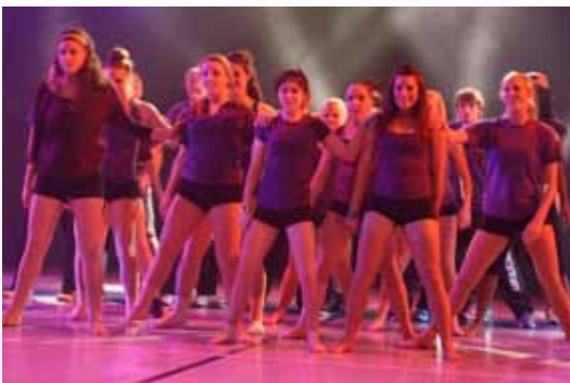
Dance Club Annual Fall Show