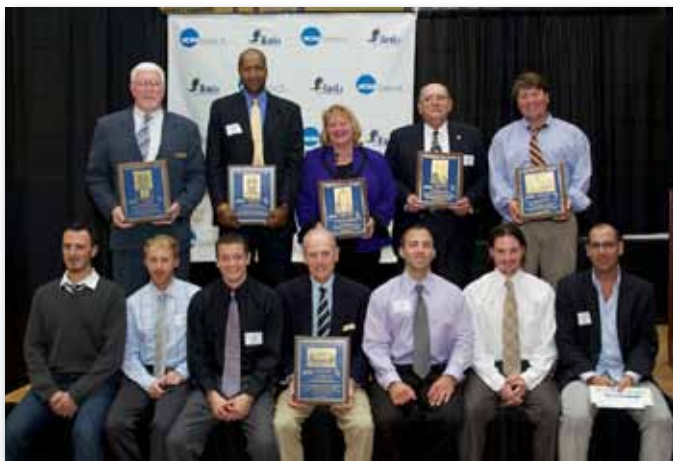
Athletics Hall of Fame Inductees 2012