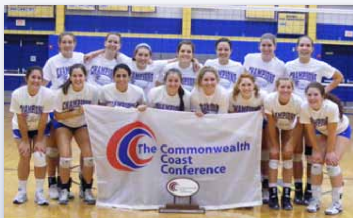
Volleyball Team Celebrates CCC Championship

Women's Rugby defeated Castleton State 48-0 at Mt. Holyoke to win the Northeast Region title and move on to Nationals. Prior to this win, the Hawks won the Colonial Coast Rugby Conference title against Wentworth. The team would go on to Cherry Hill, N.J. for the National Small College Rugby Championship where they lost 32-0 to Wayne State College. The loss to Wayne State ended their perfect record, but earned the distinction of the #2 team in the nation for small college rugby. On the men's side, the Men's Rugby team advanced to the CCRC Championship game, falling to Salve Regina. The Hawks finished the season ranked ninth in the nation for Division III Rugby.