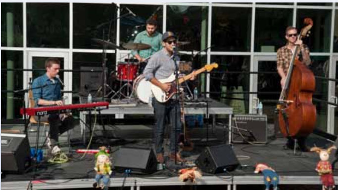
Live music is always a family favorite at Autumnfest