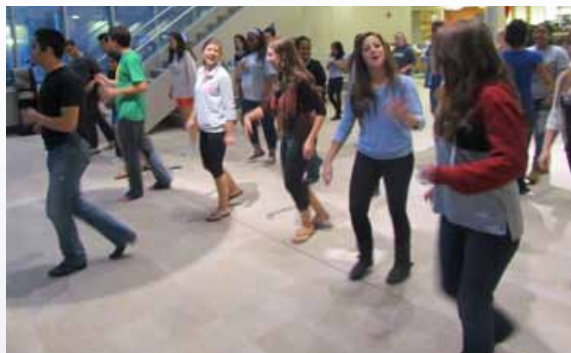
Students learning to Salsa during the Multi Cultural Student Union Latino Night.