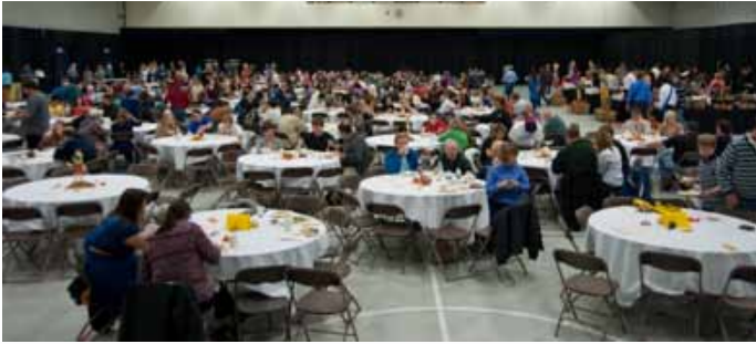
Families and Students enjoying our Annual Autumn Luncheon