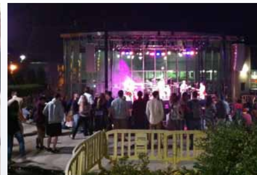
WQRI Outdoor Concert

Student Leaders involved in many aspects of extra-curricular activities finished the Fall 2012 semester on a high note. Student Programs and Leadership was excited to assist these students in coordinating 113 major events, creating student leader training and assisting students attend regional and national conferences. Some of these major highlights include