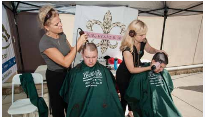
St. Balderick's Day event in action