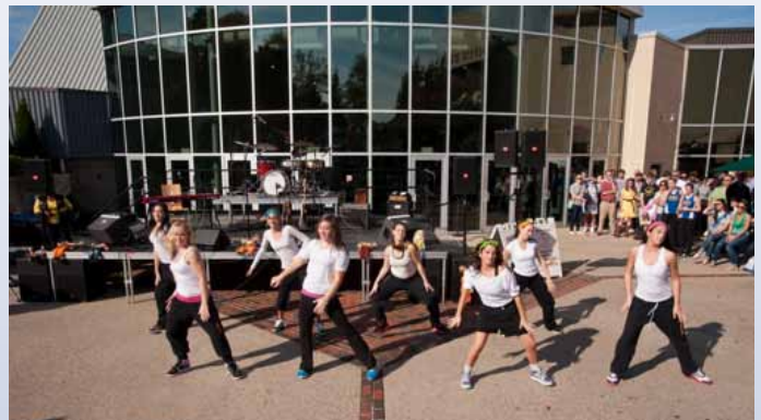
Dance Club Seniors performing for our Autumnfest crowd.