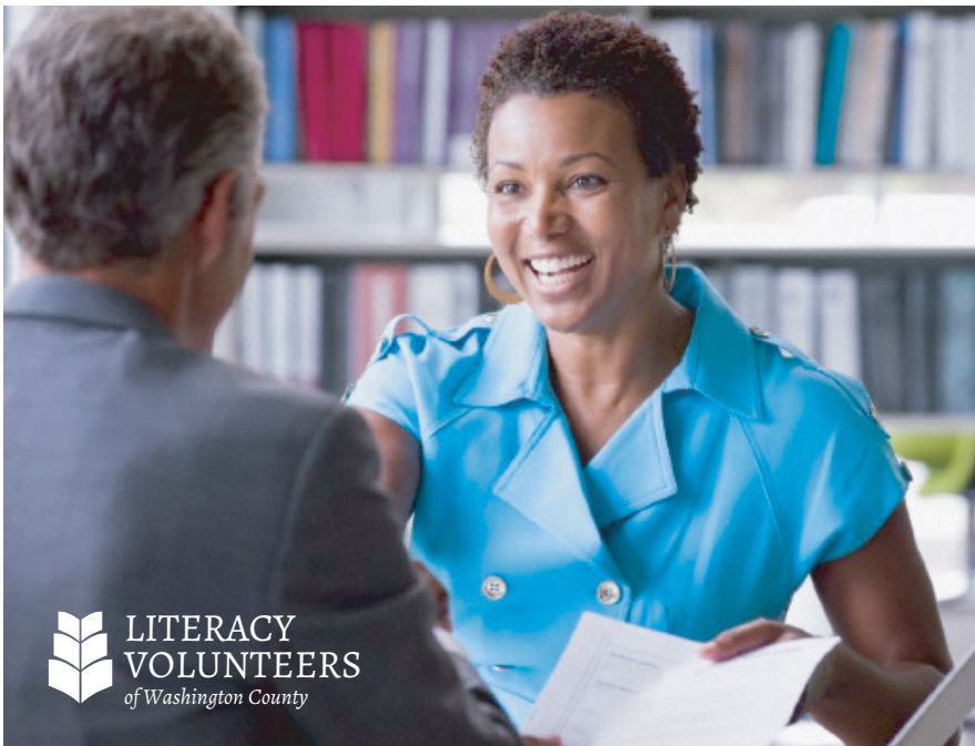
White logo over a dark corner ✓

The photos chosen for branding are very important for establishing the overall brand image.