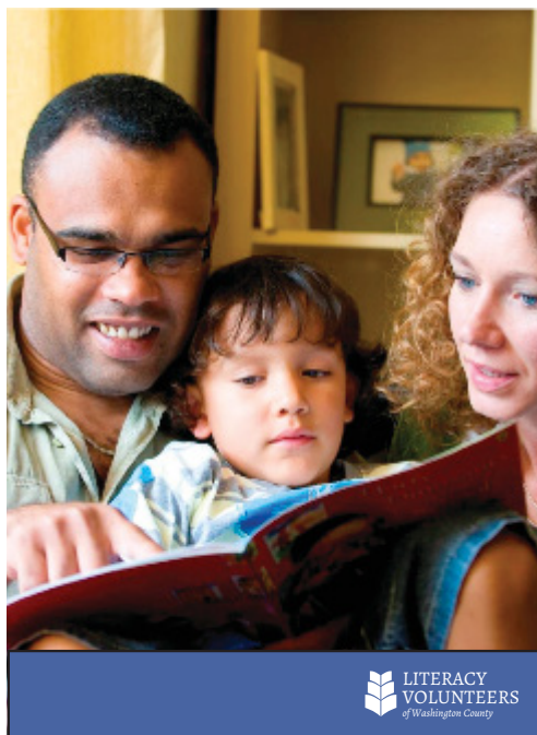
White logo on blue bar

When applying the logo to photographs, the logo should be placed in a corner of the picture. If the corner it is placed on is dark, a white logo should be utilized, if the corner that it is chosen to be placed on is white, then a light blue logo should be utilized. If the selected images does not have an appropriate spot for the logo, then a blue horizontal bar should be placed at the bottom with a white logo placed over it in the right corner.