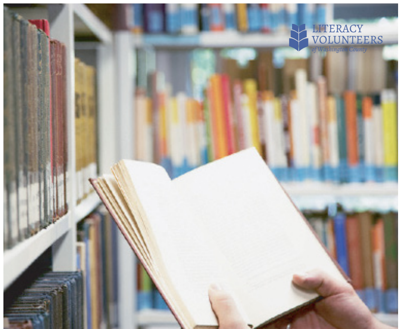
Blue logo on dark part image